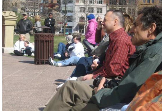
Rally attendees enjoy a sunny but chilly and windy day on the West Lawn of the Statehouse.

others, provided a cross-section of support for raising awareness of specific issues faced by families who have members with developmental disabilities, including ASD. The federal Centers for Disease Control report that the incidence of autism in the United States is 1 in 150 children, and there are more than 10,000 families in Ohio affected every day.