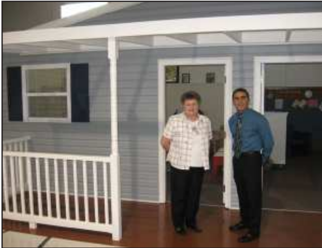
The team of Ping and Virelli stand on the porch of the scale-model home built for services to children and their families.

families. Our year-around program allows for a holistic approach to delivering services weekly to each child. In addition to offering the center-based program, the County Board offers home visits to any child determined to be medically fragile."