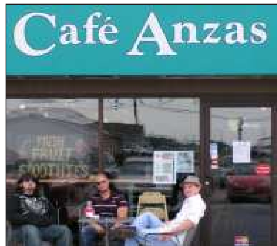
Next Chapter Book Clubs meet in community settings such as bookstores and cafes.